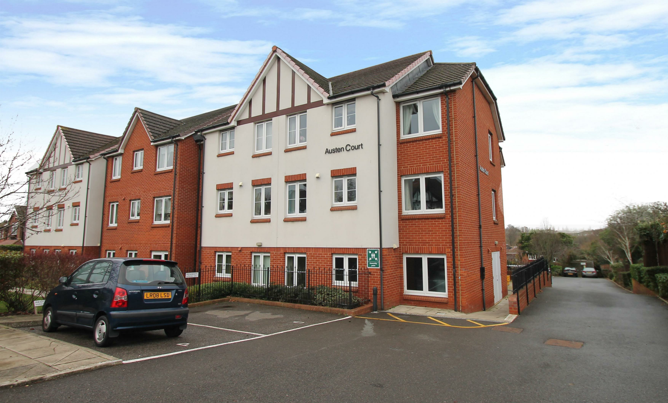
Austen Court, Winchmore Hill Road, Winchmore Hill, London, N21 Chain Free £170,000 Leasehold